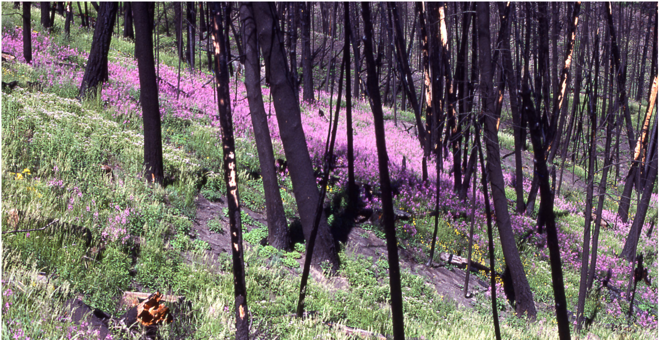
Fireweed and other flowers quickly grow after a forest fire in Yellowstone National Park.