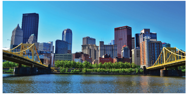
Figure 1. These photos illustrate the contrast in how two cities responded to socioeconomic collapse and environmental degradation. Youngstown, Ohio, (left) today has extensive abandoned infrastructure and faces major environmental and public health crises. Pittsburgh, Pennsylvania (right) has invested deeply in future growth and innovation, so its people benefit from environmental, social, and infrastructure improvements.