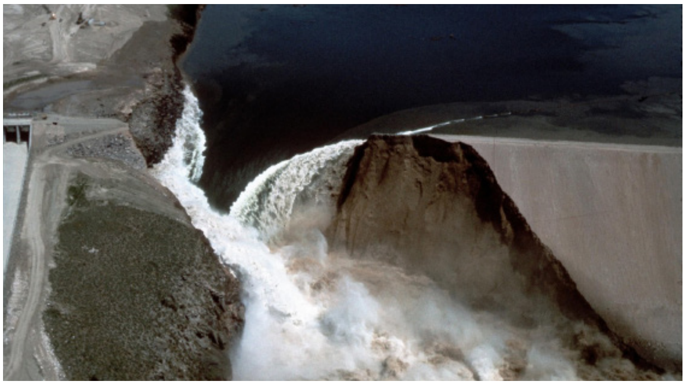
Teton Dam Failure, Idaho, June 5, 1976.