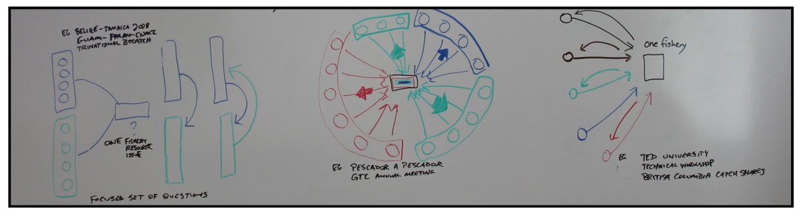
Figure 1. Pictured are examples of SESYNC teams' work to develop visual, shared mental models of different socio-environmental problems they were researching.