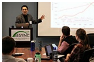
Workshop for PhD

Find complete details here. Deadline to apply is August 14, 2015.