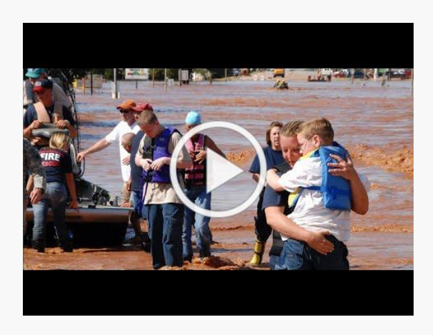
Incorporating Behavior in Socio-Environmental Systems Modeling

Check out some of these SESYNC videos on common questions and topics related to modeling socio-environmental systems! See all of our resources here.