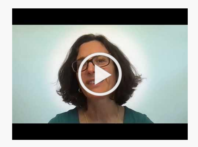
Participatory Modeling: Reshape How You Collaborate