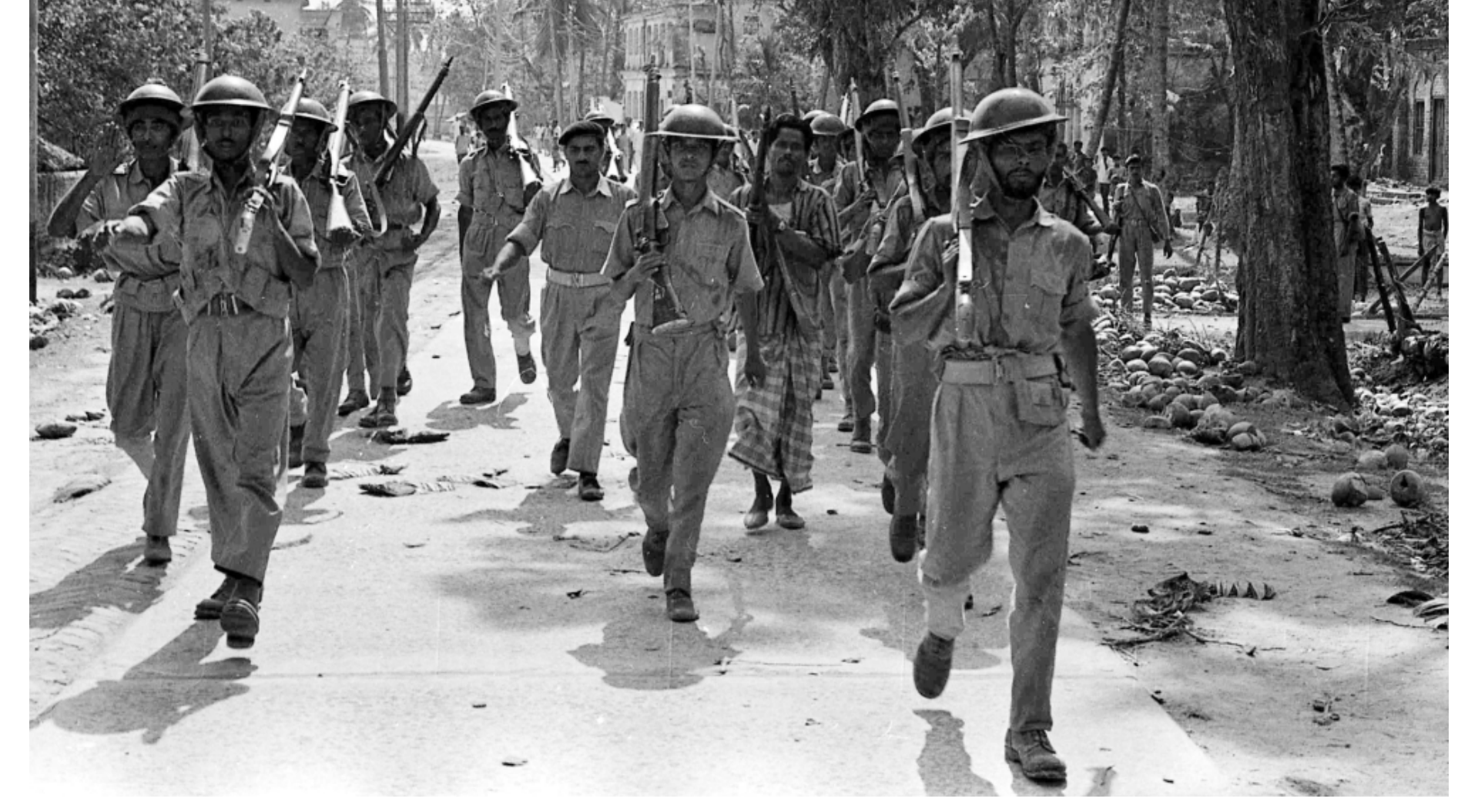
In Bangladesh, 1947 is a distant memory, erased by the much fresher bloody ones of 1971

If India was being partitioned, it was argued, Bengal had to be.