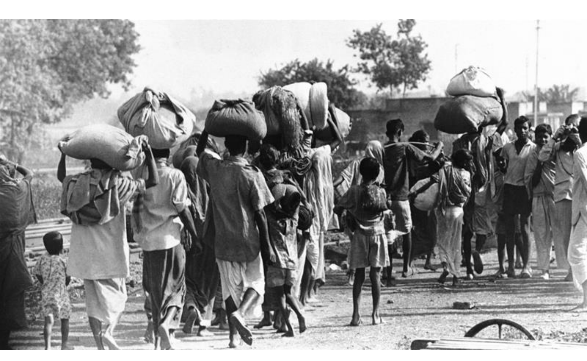
In Bangladesh, 1947 is a distant memory, erased by the much fresher bloody ones of 1971

Correction: 14/08/2017: The Jogisu attack happened in May 1971, not in June, as stated in the earlier version of the story. Also the Hindu parties were not part of the official United Front.