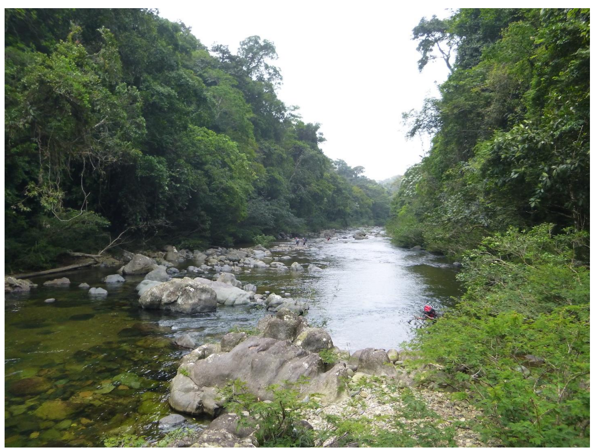
Pristine forests and rivers with crystalline waters in the Bayano Region