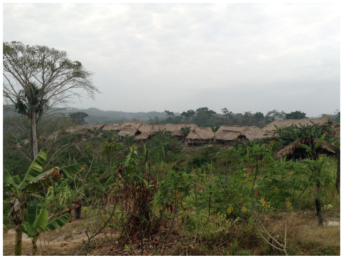
Kuna village nestled in the forests of the Bayano region.

informally divided in three regions, those along or near the Pan-American Highway, those located on the shores of the ~300km<sup>2</sup> artificial Lake Bayano, created when the Bayano River was dammed, and those established along rivers that drain to Lake Bayano.