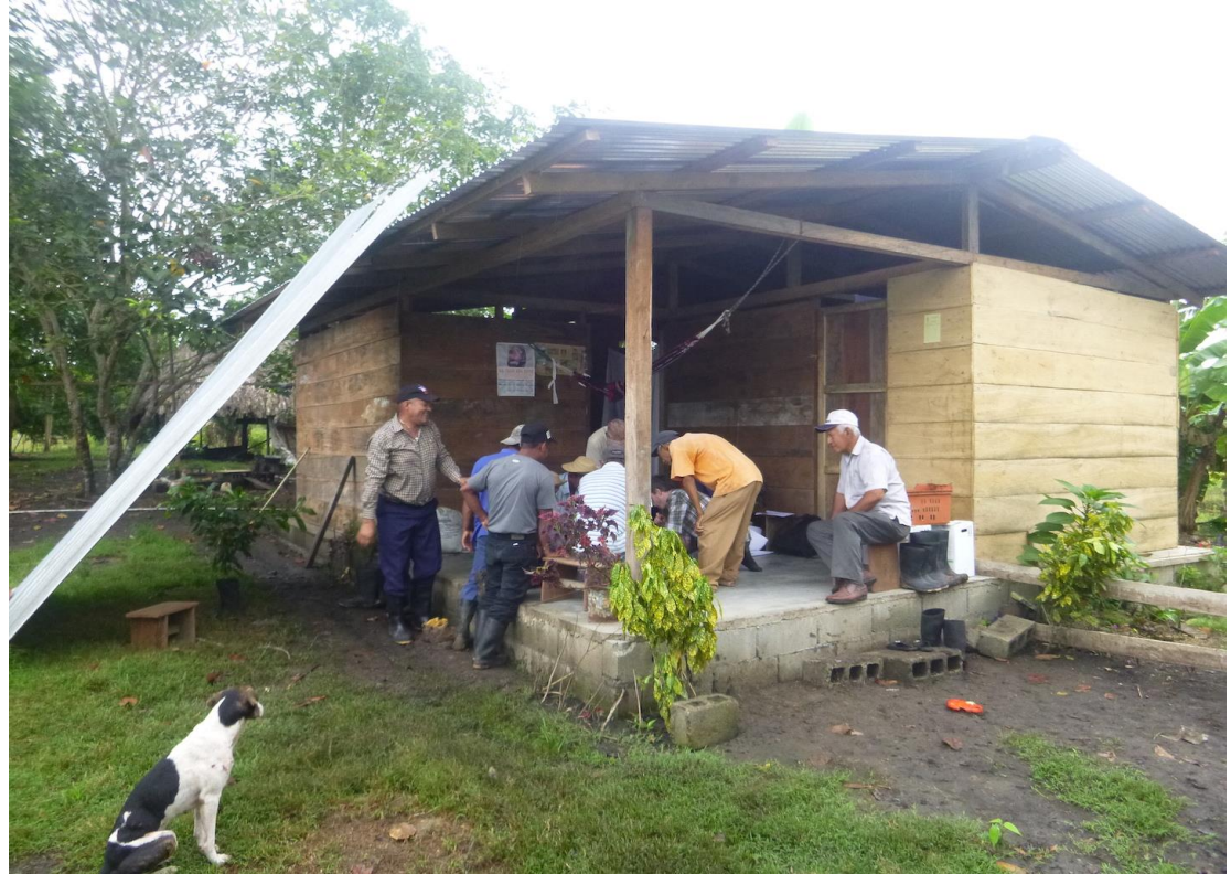
Colonos live in dispersed houses throughout the Bayano region.

Colonos : Colonos began to arrive in the Bayano region in the 1950s, with colonization steadily increasing with the construction of the hydroelectric dam and the Pan-American Highway over the following three decades (Wali, 1989b). These farmers, primarily of mestizo origin, migrated mostly from the central and western provinces of Panama in search of land, and implemented their traditional agricultural practices of subsistence farming, followed by pasture establishment for low-density cattle-ranching (Heckadon-Moreno, 1984). For the most part, they manage small farming units, which they clear on their own or with limited support, as they typically have limited resources to do so. Few will have land title, but many do obtain "possession rights", which are legally recognized by the Government of Panama, but do not carry the same weight, particularly when trying to access bank credit (Peterson St-Laurent et al. , 2012).