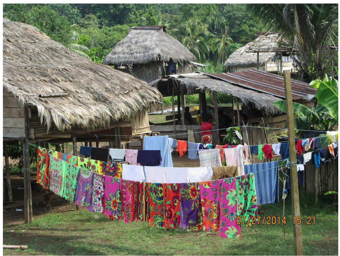
Traditional Emberá village in eastern Panama.

deforestation are no longer able to benefit as much from traditional uses of the forest. The most evident manifestation of this has been the rapid and widespread shift from traditional Embera architecture to mestizo building methods employed by colonos . The traditional huts, built on stilts and with materials from the forest, have given way to ground-level cinder block homes with metal zinc roofs, because access to the forest is now too far away to source natural, yet heavy, construction materials. The Emberas in the Bayano region have experience with carbon sink projects, including a native tree species reforestation project in the community of Ipeti established in collaboration with the Smithsonian Tropical Research Institute to offset the institution's carbon dioxide emissions. Despite this, they have not formally accepted to participate of the national REDD+ strategy that is being advanced by the government of Panama.