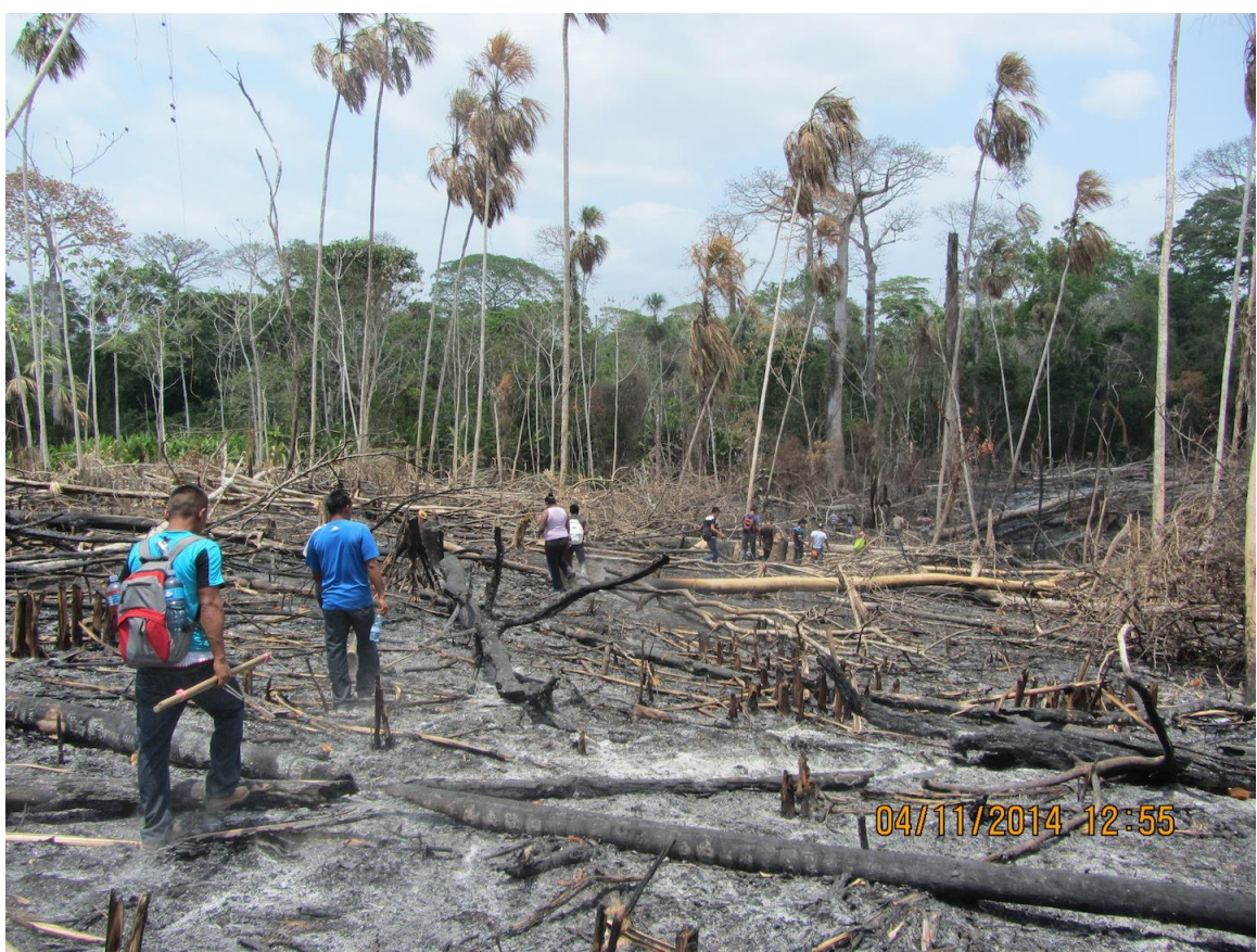
Deforestation in eastern Panama.