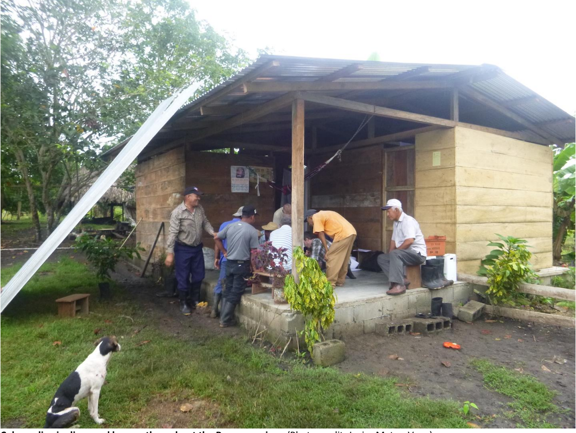
Colonos live in dispersed houses throughout the Bayano region.

Colonos: Colonos began to arrive in the Bayano region in the 1950s, with colonization steadily increasing with the construction of the hydroelectric dam and the Pan-American Highway over the following three decades (Wali, 1989b). These farmers, primarily of mestizo origin, migrated mostly from the central and western provinces of Panama in search of land, and implemented their traditional agricultural practices of subsistence farming, followed by pasture establishment for low-density cattle-ranching (Heckadon-Moreno, 1984). For the most part, they manage small farming units, which they clear on their own or with limited support, as they typically have limited resources to do so. Few will have land title, but many do obtain "possession rights", which are legally recognized by the Government of Panama, but do not carry the same weight, particularly when trying to access bank credit (Peterson St-Laurent et al., 2012).