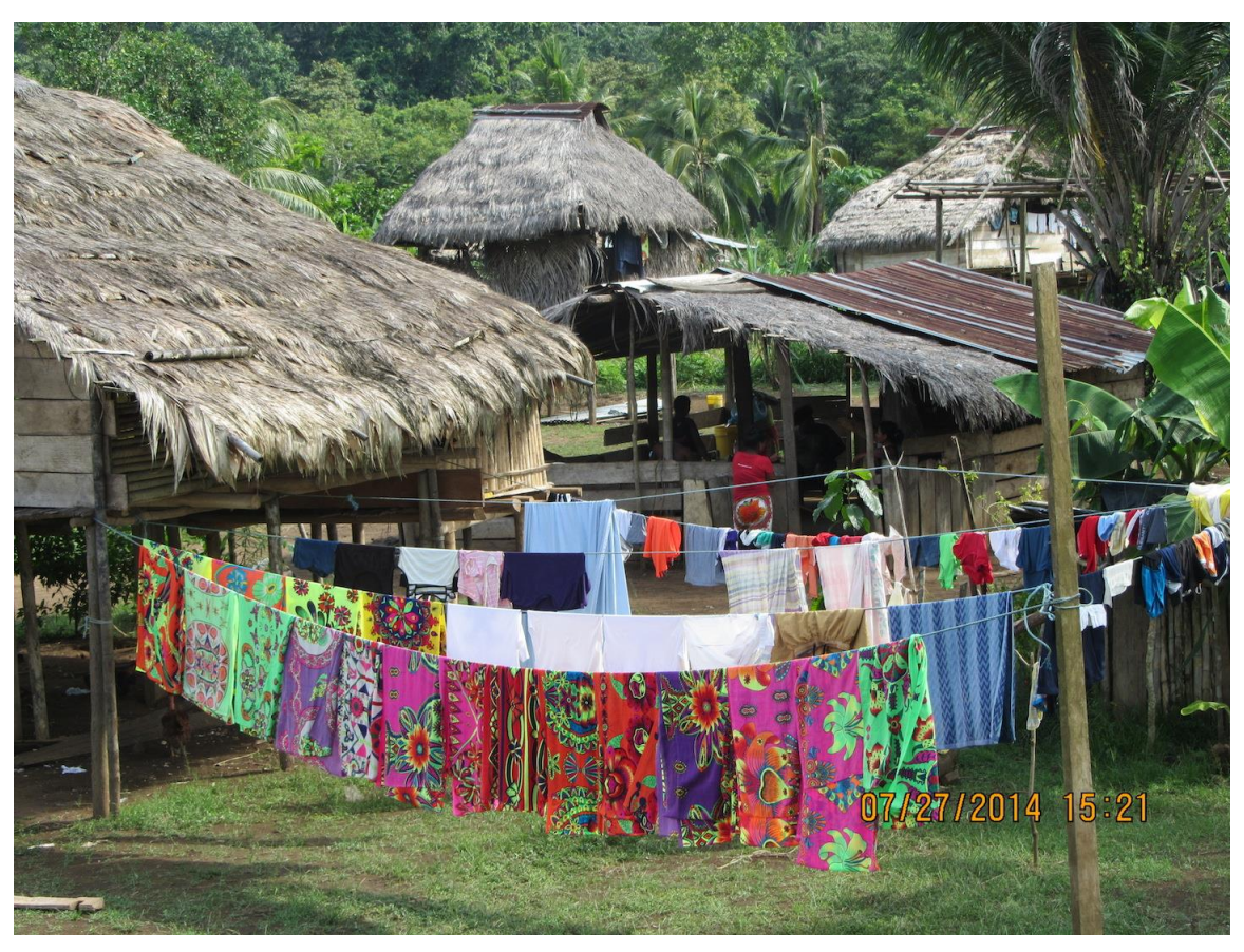
Traditional Emberá village in eastern Panama.